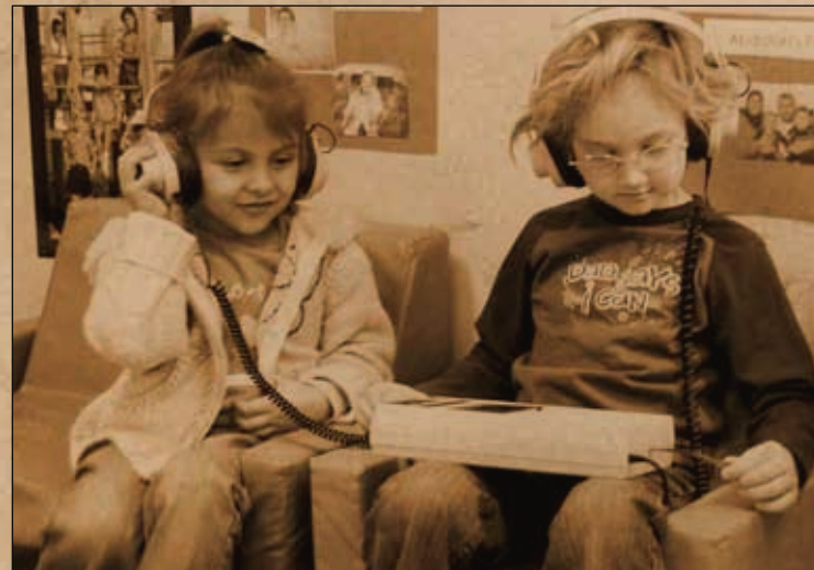
Students in the Head Start program listen to a book on tape.