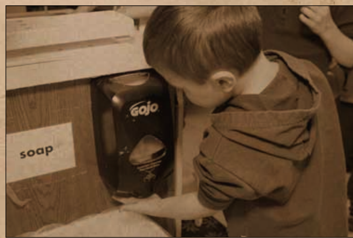
A student in the Head Start program washes his hands after playing.