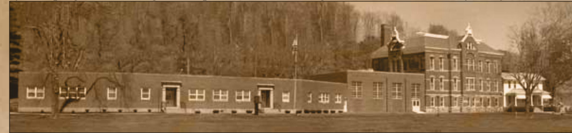
Lancaster-Fairfield Community Action Agency, located at the site of the former Fairfield County Children's Home in Lancaster, Ohio, cir. 2009

As always, I would like to personally thank our committed Board of Directors, our tireless and talented staff of dedicated employees, our generous donors and volunteers, and all in our community who collaborated to help us cushion the blow of the current economic crisis for so many of our neighbors and friends in Fairfield County last year. •