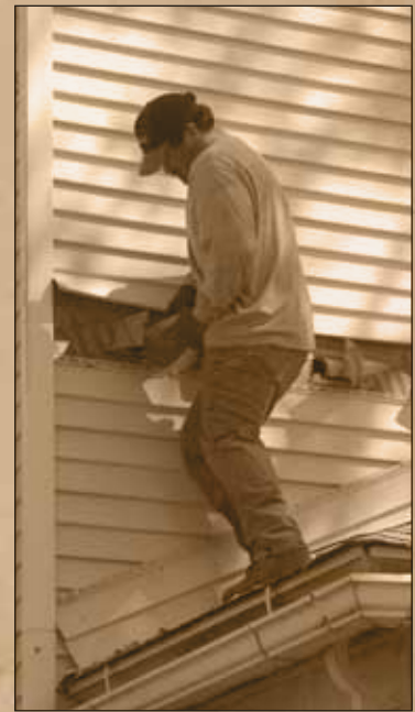
Weatherization crew member install insulation in customer's home.

AEP's Electric Partnership Program (EPP) is a targeted energy efficiency and consumer education program. It is designed to minimize electrical consumption for Percentage of Income Payment Plan (PIPP) participants. The Passport Minor Home Modification Program is designed to complete home modification repairs and address health and safety issues. •