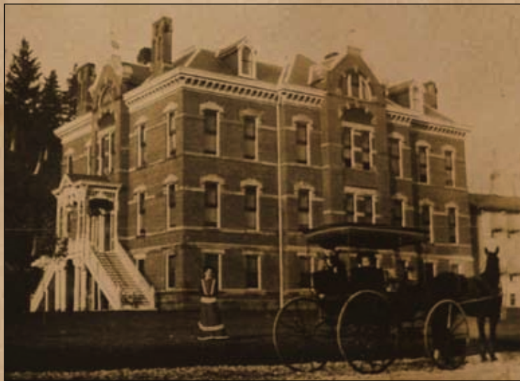
Former Fairfield County Children's Home, pictured here (cir. 1890) has been placed on the National Register of Historic Places by the U.S. Department of the Interior.

Meet their Board of Directors, staff and partners