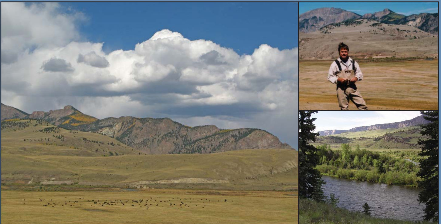
Clockwise from the top: Landowner, Alan Lisenby: View of the Rio Grande: Rio Oxbow Ranch Landscape by John Fielder

Stretching along the Silver Thread Scenic Byway, Highway 149, above Creede in Mineral County, RiGHT recently conserved 505 acres of the historic Rio Oxbow Ranch. This is Phase I of a two phase project that will protect an additional 570 acres in 2009. Overall, the ranch encompasses six miles of the Upper Rio Grande and has an extensive boundary with the Rio Grande National Forest. The owners and managers of this ranch have been recognized for their excellent management of the riparian area, which supports abundant populations of elk, deer, moose, beaver, many other small mammals, waterfowl, and migrating birds.